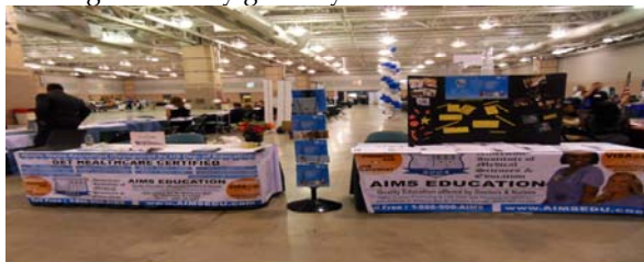
VA convention in Atlantic City, NJ

Shortly after inception our school became an approved training provider for unemployed students of WDP and WIA categories from various counties. We are also approved to train students on TRA sponsored by big companies. We have nearly 30 to 40 percent of students availing this facility given by the Government.