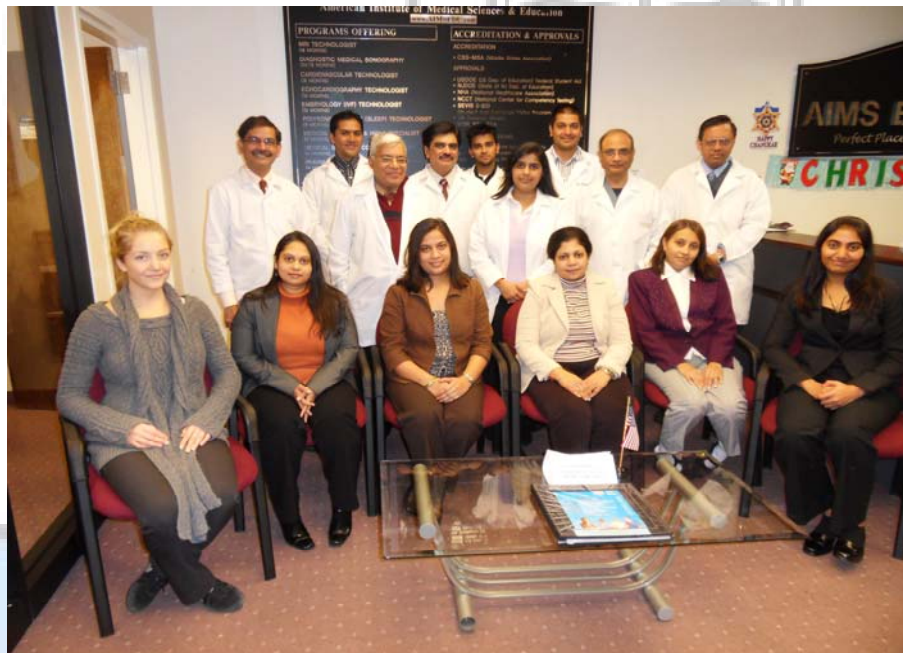
"AIMS Education staff – A Team of achievers..."

In a nut shell AIMS EDUCATION'S progress in every field has become now evident. Nevertheless despite hurdles to be at the best always, every one could visibly perceive growth and development. Constant improvisations are being made to achieve the end goal which is "Quality". Uncompromising steps and untiring measures are taken to render education in the truest sense. "To strive for mastery" has become the Golden Password to enter the portals of AIMS EDUCATION and one can sense the upcoming blazing success trail in the years. We will stay committed to strive and retain our past achievements and continue to deliver better for the present and the future. Beats for this walk - a- thon will continue forever at AIMS EDUCATION.